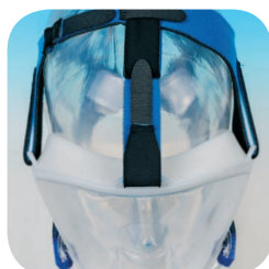
The fifth point of attachment allows a better sealing onto the patient's forehead