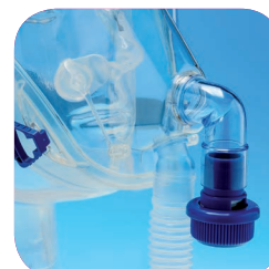
Configuration with single limb ventilator or CPAP Generator