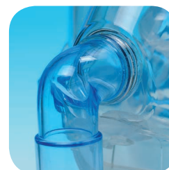
"Non-Vented" elbow for single limb ventilator