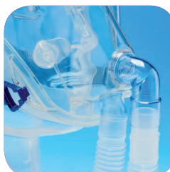
Configuration with dual limb ventilator