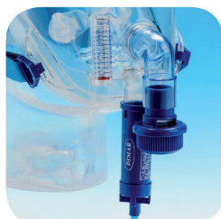
Configuration for CPAP with "Easy Vent" Venturi Generator